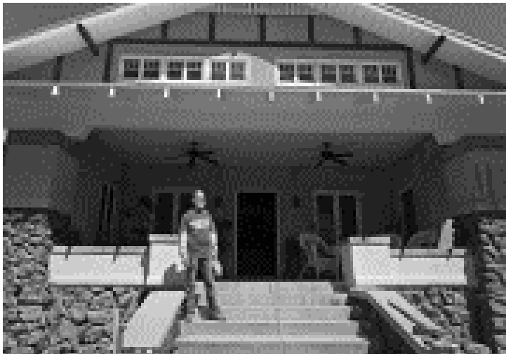
Massive bungalow style home built by Anna Lester, 1200 block of Lester Street (Photo: 2016)