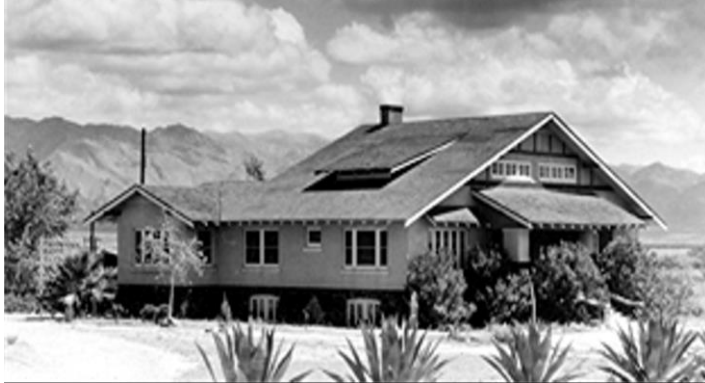
This house was built by Lester and stands today east of the original home site. (Photo circa 1920)